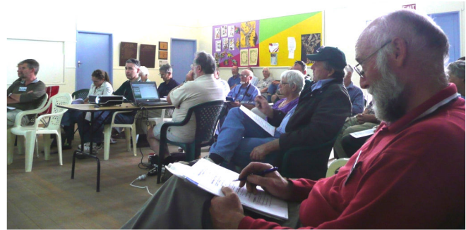
April Reporting-back meeting in Rainbow