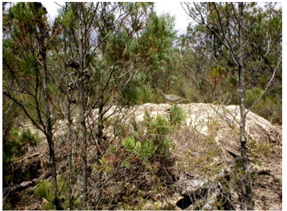
Male malleefowl tending nest in Nurcong, 2005

It's hard to be sure why these declines have occurred, and why the north-east seems to have been spared. Rainfall has been poor for several years, but it is unclear whether this can explain all the patterns in breeding numbers. Other data collected in the course of monitoring may hold some clues (trends in fox signs and Malleefowl footprints, etc), and we need to know how much of the variation we are seeing, and the trends, can be explained by rainfall patterns.