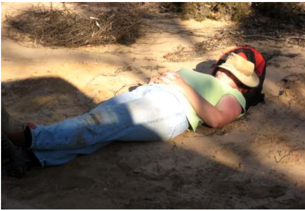
Contemplating all the beautiful bush discoveries?