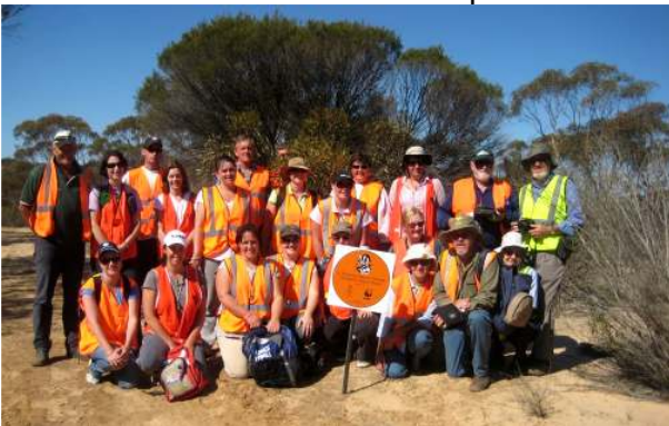
Re-searchers at sunny Wathe

The afternoon was getting quite warm as they set off on the final walk with tired legs. They all finished the re-search around 4.30pm.