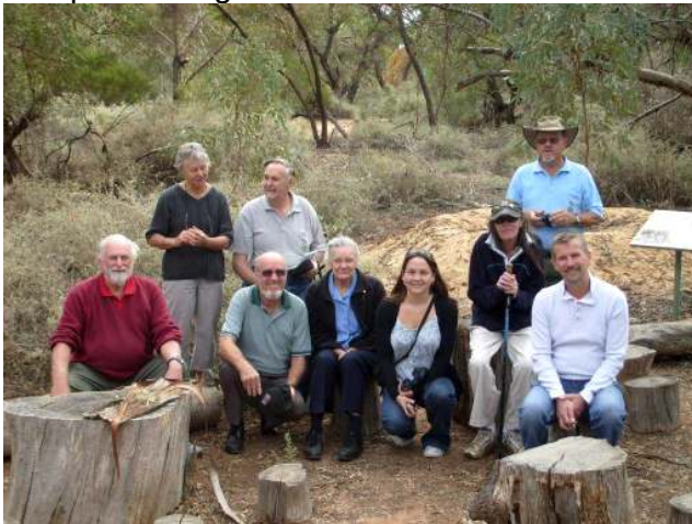
At the Gardens in front of the Malleefowl mound

Some of our members visited the Australian Inland Botanical Gardens near Buronga NSW for a very enjoyable walk through the Mallee section with plants indigenous to the Mallee area.