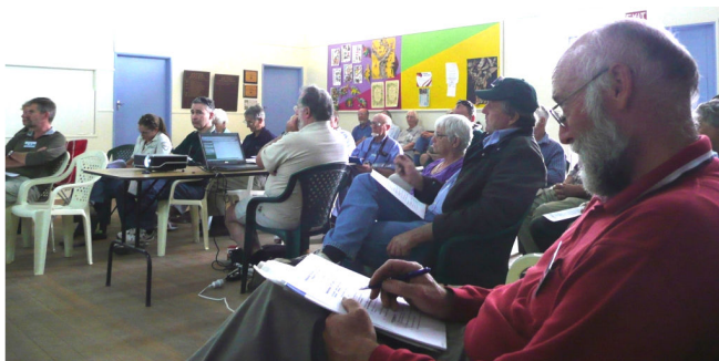
April Reporting-back meeting in Rainbow

You may have noticed that VMRG is getting bigger and the work and demands are increasing. Government funding appreciates voluntary help, but it means we have to do the work. And if we want to satisfy our aims to recover Malleefowl population and habitat there's no choice really!