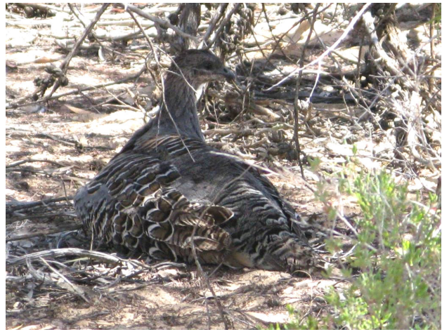
A brief rest