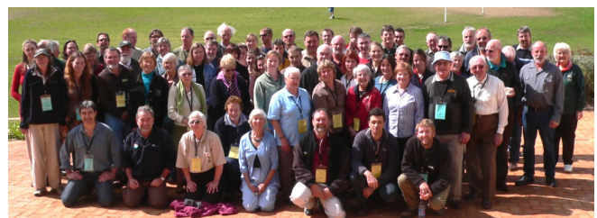
Participants in the Forum at Katanning

Some information from the proceedings will be presented in the next few newsletters.