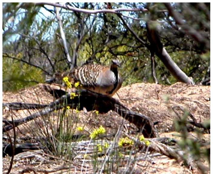
Malleefowl seen during monitoring

Extracted from a report from- Joe Benshemesh