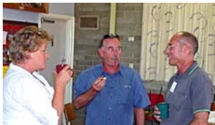
Afternoon tea discussion

10. Members be surveyed for opinions and the results be considered by the committee at the July/August meeting