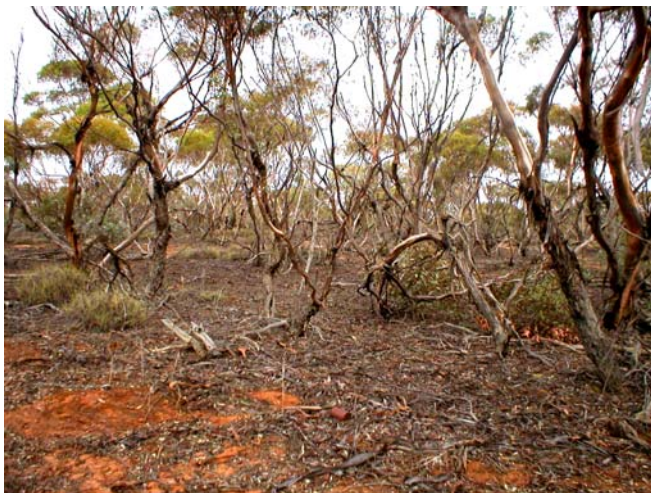
Old Mallee at Nowingi, near proposed site