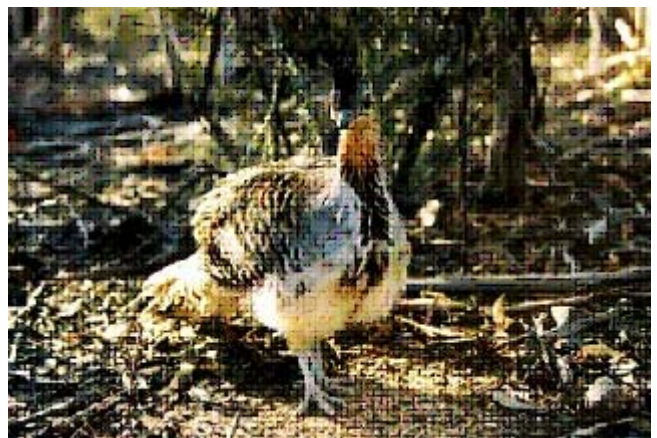
Young male threat display

During the breeding season, the male birds appear to spend most of the day near the mound, whereas the females spend the morning at the mound to assist with tending and for egg laying, and again in the late afternoon to assist with the final neatening of the mound.