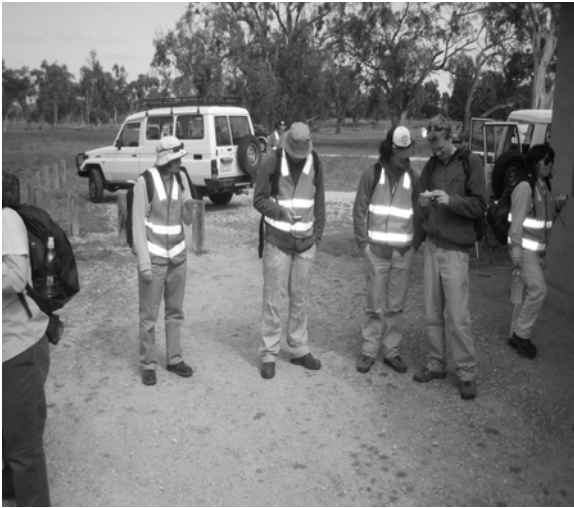
RMIT students familiarise themselves with essential field equipment

Fifty-six of the known sites were found along with a further 4 new or previously unfound nest sites. Students worked in two groups walking through the mallee scrub along grid lines predetermined by GPS coordinates at intervals of 10-15 metres visually identifying any malleefowl mounds. At 75 % success rate this meant that the group surveying the area were reasonably successful and efficient in their field efforts.